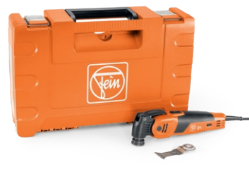
MM 700 Multimaster Starlock Oscillator