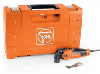
MM 500 Multimaster Starlock Oscillator