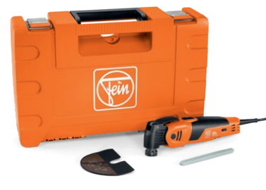
MM 700 Multimaster Automotive Oscillator 1.7Q