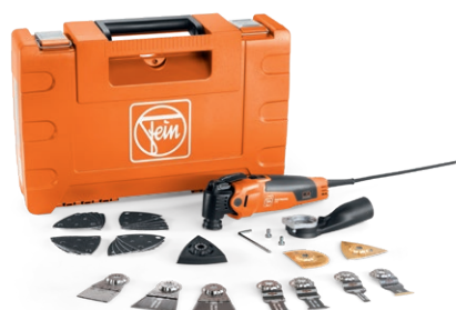
also available with additional accessories MM 500 Multimaster Starlock Oscillator TOP Set