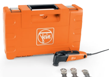
MM 300 Multimaster Starlock Oscillator START Set